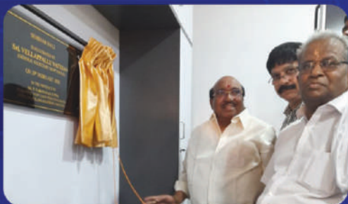
Seminar Hall Inauguration