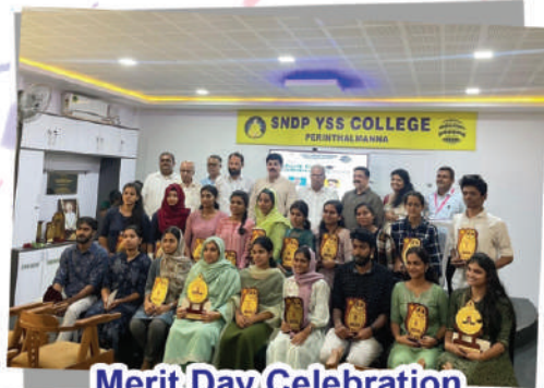
Merit Day Celebration