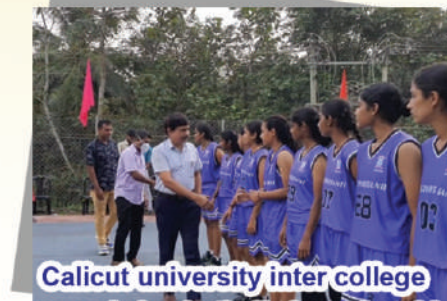
Calicut university inter college women's basketball championship