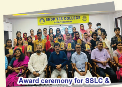
Award ceremony for SSLC & PLUS TWO Students